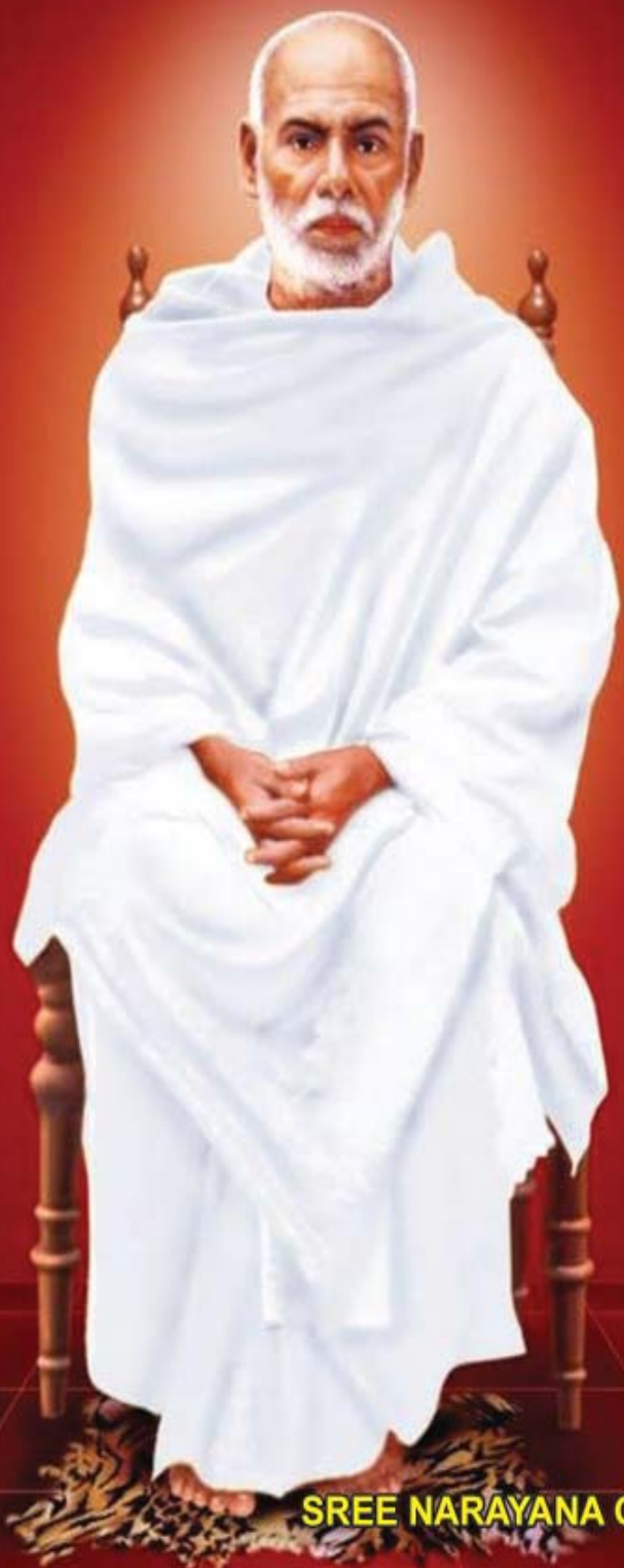
SREE NARAYANA GURU