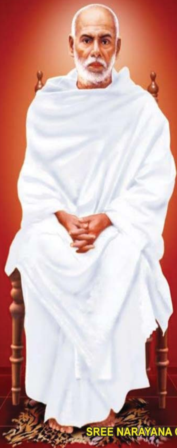
SREE NARAYANA GURU