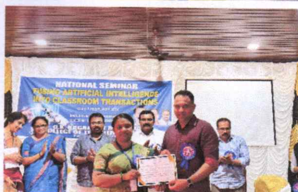
One Day National Seminar on "Fusing Artificial Intelligence into Classroom Transactions" held on 09/02/2024